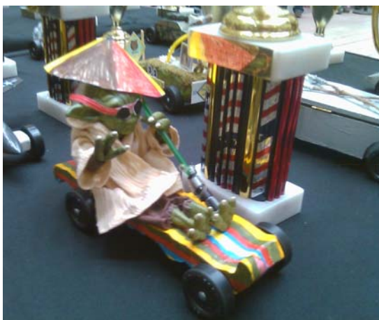
Two "cars" from the recent Pinewood Derby. See story on page 7.