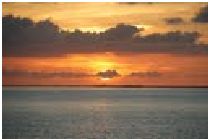
Sunset at Seabase.