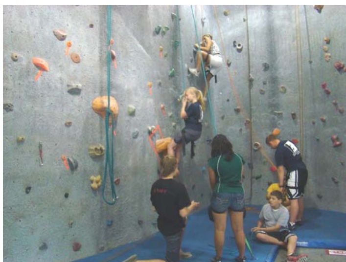
Venture Crew 610 practices climbing at Sportrock.