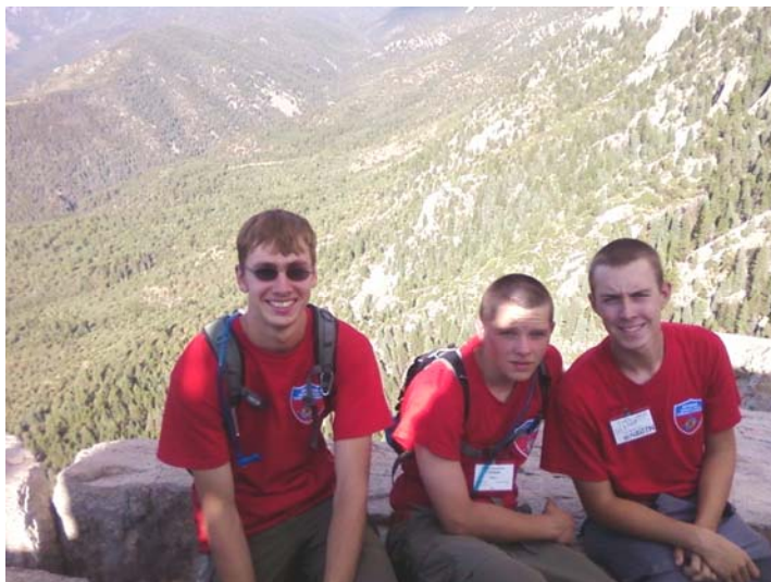
Members from Crew 4522 on top of the Tooth of Time while attending the National Advanced Youth Leadership Experience (NAYLE) at Philmont Scout Ranch in July.