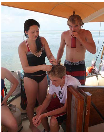
Above: NCAC Sea Base Council Contingency Crew (Old Dominion District Crew 3200, Troop 1115, and Ship 1115) on the Jolly II Rover.