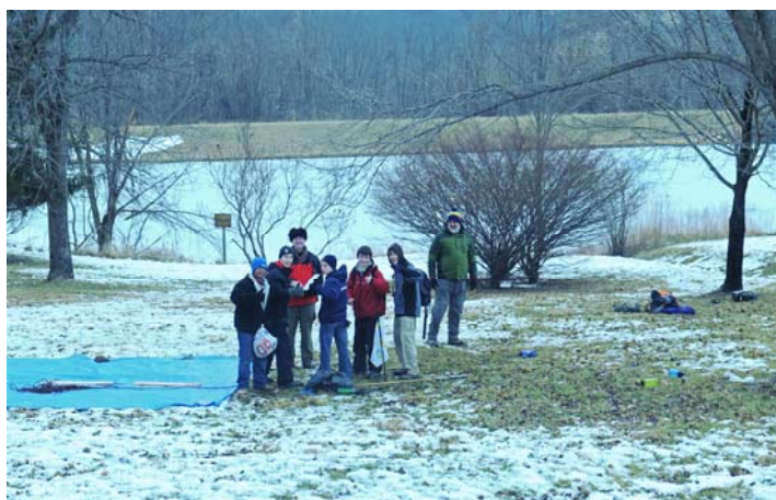
Patrol team work at the Klondike Derby

Congregation Adat Reyim is located at 6500 Westbury Oaks Court in Springfield, Virginia, just off Old Keene Mill Road. 703-569-7577. http://www.adatreyim.org . All are welcome.