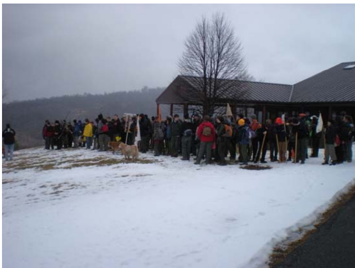
Photos from the 2011 Klondike Derby

Mark your calendars for 3-5 February 2012 as we look to pan for gold in Front Royal at the 8th Annual Klondike. Expect new challenges and twists on old ones! Add it to your Troop's annual plan. We'll be looking forward to seeing old friends and new friends in creek beds searching for gold next year!!