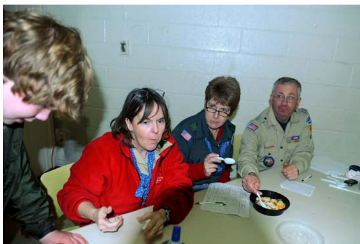
Judging the Golden Spoon at the Klondike Derby