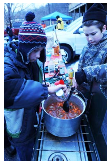
Cooking for the Golden Spoon at the Klondike Derby