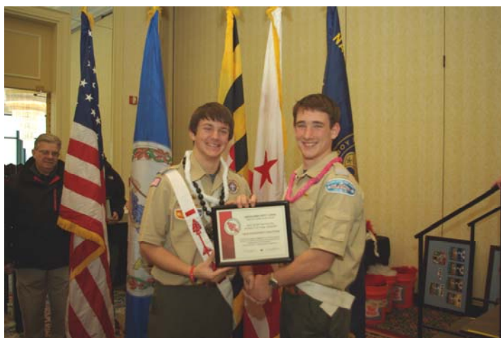
Above: OA Old Dominion Chapter Chief receives the Honor Chapter certificate from Lodge Chief at the January 8th Lodge Banquet. Below: New Vigil Honor member with the Lodge and Chapter Chiefs.