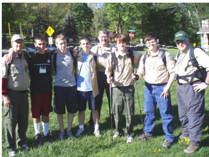
Above: Team and Crew 1511 hiking the AT Below: V3 Rockband Competition at the Spring Camporee

New Unit Coordinator — Vacant HELP WANTED