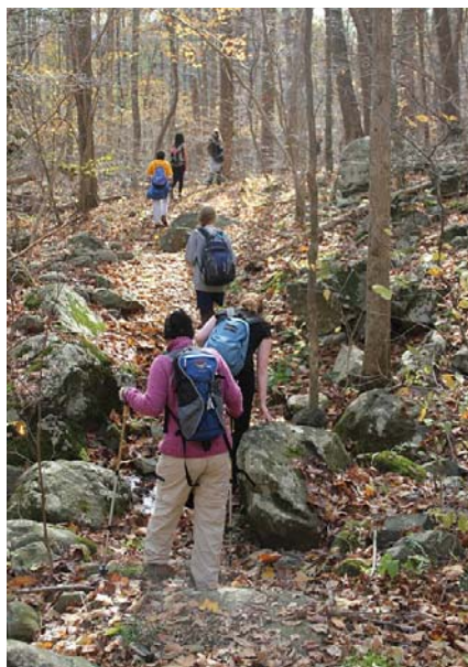
On the trail at the 2010 Hike-o-ree

Online Training—you will need your ID number provided on your registration card from BSA if you have one, if not you can take the training and then add your number to your profile when you receive it—s found by going to the NCAC web site and looking under the training tab.