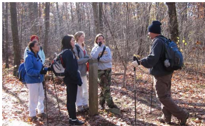
Old Dominion District's newest Venturing Crew 3200 takes to the trail in the 21st Annual Hike-o-ree.