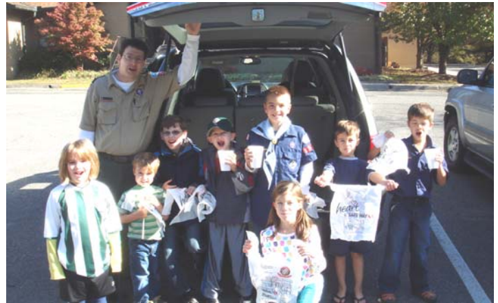
Above: Pack 1511 and friends working SFF.

We have officially kicked off the 2010 Scouting for Food Drive! Despite a few area overlaps, we delivered 50,000 Scouting for Food bags, and look forward to a huge collection on November 13 th . Please ensure your unit has a method for recording the amount of food you collect for ODD record-keeping purposes. We will also be tracking this information at one of the three area food banks. THERE IS NO CONTEST --but those who need food will be greatly blessed because of your efforts, and we need the information to refine next year's food drive.