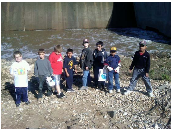
Cub Scouts from Pack 678 after participating in the Lake Accotink Watershed cleanup on October 16 th .

It is time to start planning for Scout Sunday, February 6 th , and Scout Sabbath, February 13 th . This is especially important for units that are sponsored by a religious organization.