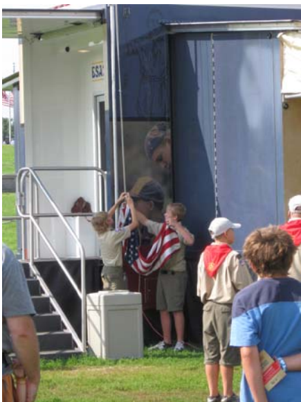
A First Class from Troop 150 in Annandale participating in a flag raising ceremony at Adventure Base 100 on the Mall.