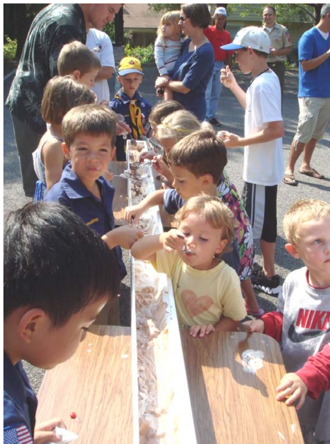
From the Pack 1511/1535/1538 Tri-Pack Raingutter Regatta. The grand prize for all the participants was a Raingutter Ice Cream sundae.

Scouts and Scouters, mark your calendars for September 18, 2010! The Old Dominion District will be holding its Inaugural Clay Shoot / NRA Day at the Fairfax Rod and Gun Club. See the flyer on page 12 for more details.