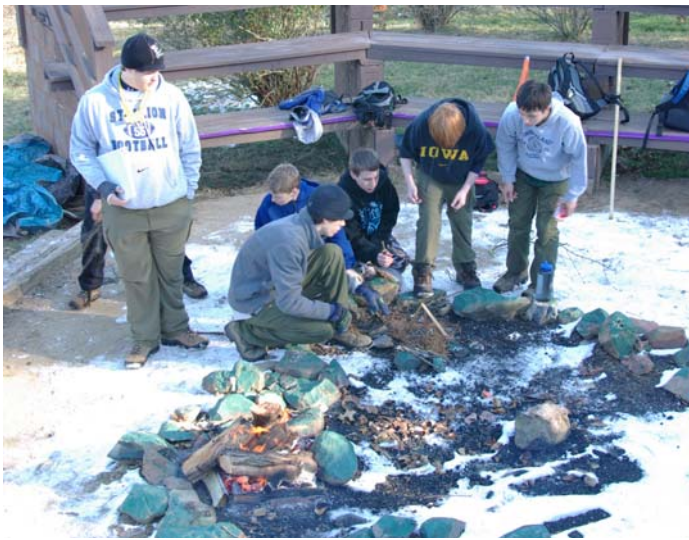
(Continued from page 13)

One Scoutmaster shared that “During all my Scoutmaster Conferences, the Klondike is either number one, two or three event for most Scouts.” Our aim has always been to deliver a quality program – our motto is “if we build it, they will come.” The Klondike Derby is a choice and one that has seen troops return annually because it delivers the Scouting Program. After the first year, we have rented out each of the rooms and have had many troops camping. The end result is always the same: A great event mixing challenges for the Scouts with good clean activities.