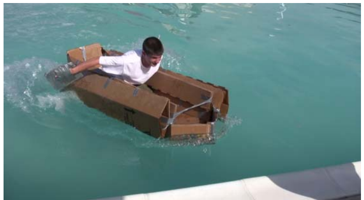
Among the best and fastest cardboard boats at the Fall Camporee. See story on page 11.