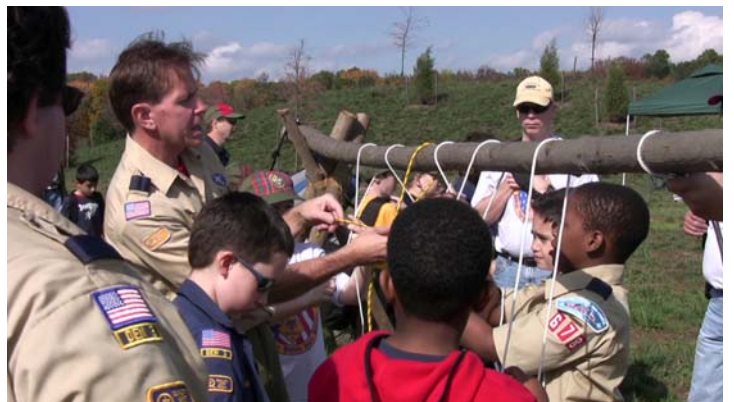
Right; Webelos Scouts enjoy archery and learn basic knots at the Webelos-ree. See story on page 11.