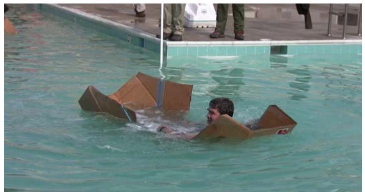
An unidentified (he hopes) adult "sails," or is it "sinks," his cardboard boat at the Fall Camporee. Story on page 11.

Please contact us if you have any questions.