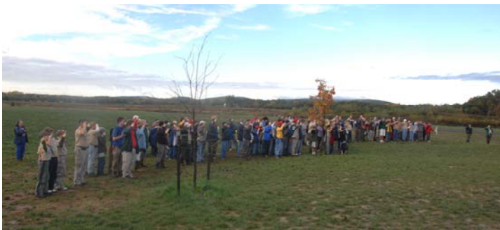
Morning formation as the weather clears at the Fall Camporee

Pack 1229's Webelos served as the color guard at the Jeb Stuart High School football game on October 12. They presented the American, state and pack flags for the National Anthem. They represented our country, district, and pack with honor, and performed their duty perfectly. This was also a good opportunity to get our pack involved in the local community with service. Great job Webelos!